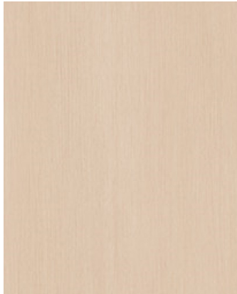
* PHANTOM ECRU 8212-60