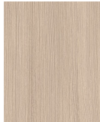
* HIGH LINE 7970-60