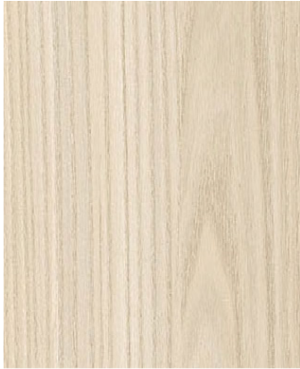
* FIELD ELM 7999-60